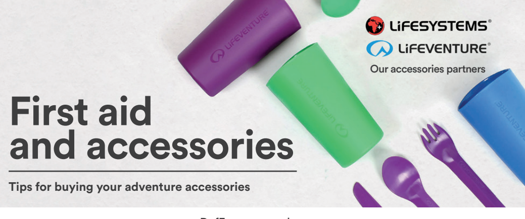
DofE recommends: Lifesystems Trek First Aid Kit, Head Torch, SoftFibre Lite Towel, Dry Bag 5L